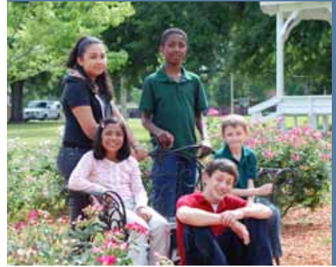
Pictured are some of the wonderful kids on our Lakeland campus!