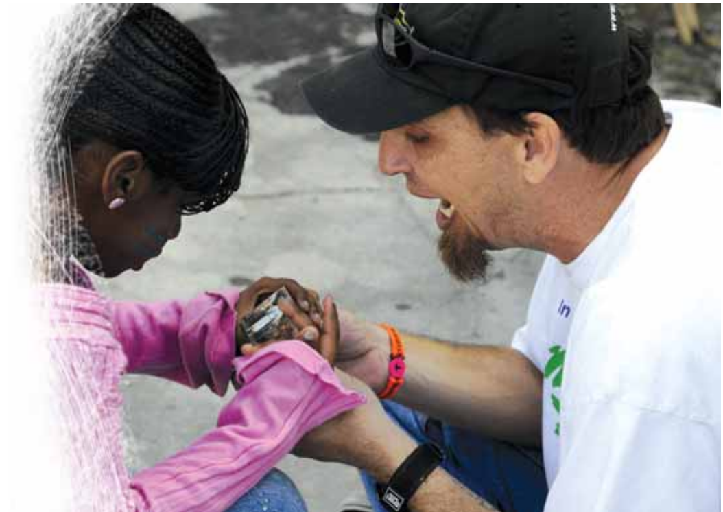
touching hearts changing lives The 2012 Cooperative Program